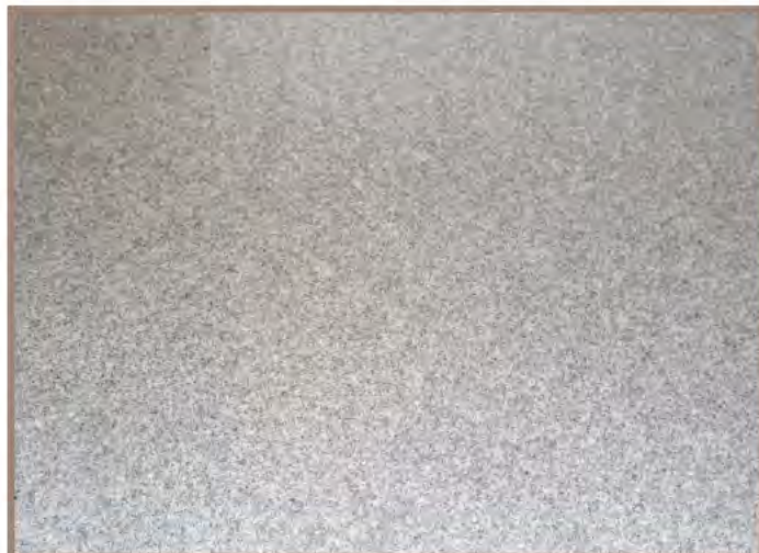
After treatment with MicroGuard® AD703

Location: Precision Industries Plant – Employee Bathroom; adjacent to paint spray booth.